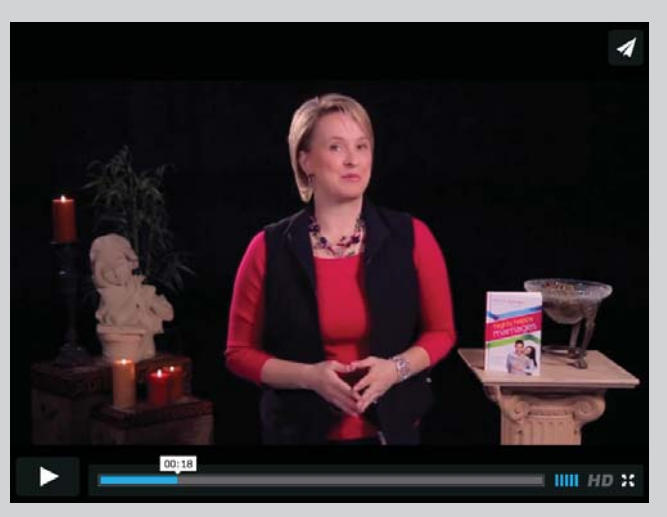
<u>Happy Couples...Believe the Best About Their</u> Spouse No Matter What.